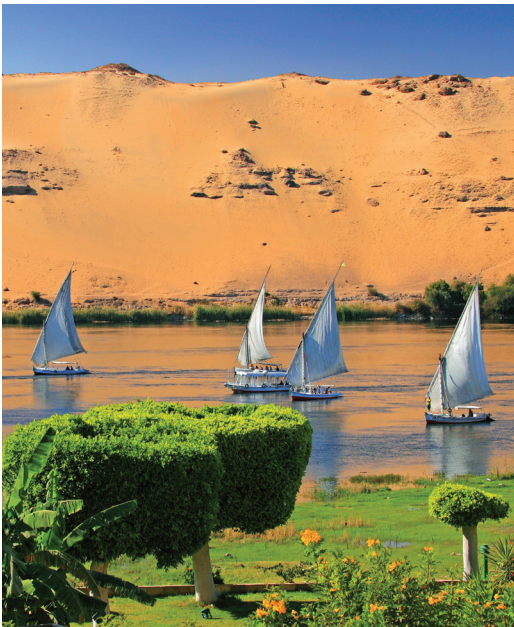
We sail traditional feluccas along the Nile.

Day 14: Cairo Today’s touring begins at the open-air museum at Memphis, Egypt’s first capital