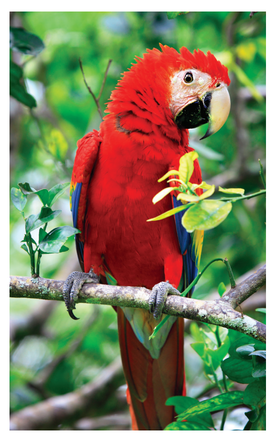
Costa Rican parrot -- one of 16 native species