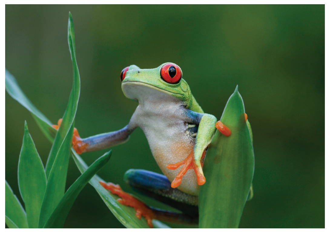
We see many colorful tree frogs in Costa Rica's rainforests.

Day 5: Arenal Region On this morning's visit to Arenal's Mistico Park hanging bridges, we have the special opportunity to experience the rainforest from the canopy level as we traverse a series of five suspension bridges high above the forest floor. While we observe the rainforest from a unique perspective, our naturalist guide will point out some of the flora and fauna that thrive here. Then we return to our hotel, where the remainder of the day is at leisure to relax amidst the beautiful grounds and thermal waters. Lunch and dinner today are on our own. B