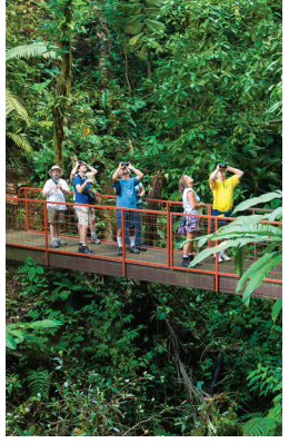
Arenal's hanging bridges

day at leisure along one of Costa Rica's most beautiful Pacific Coast settings. B,L