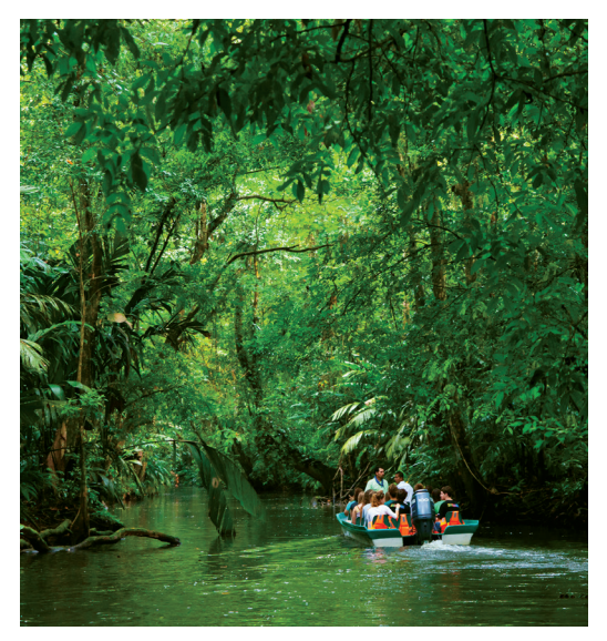
We explore Tortuguero's canals on the pre-tour option.

Day 11: Depart for U.S. We transfer to the airport this morning for our return flights to the U.S. B