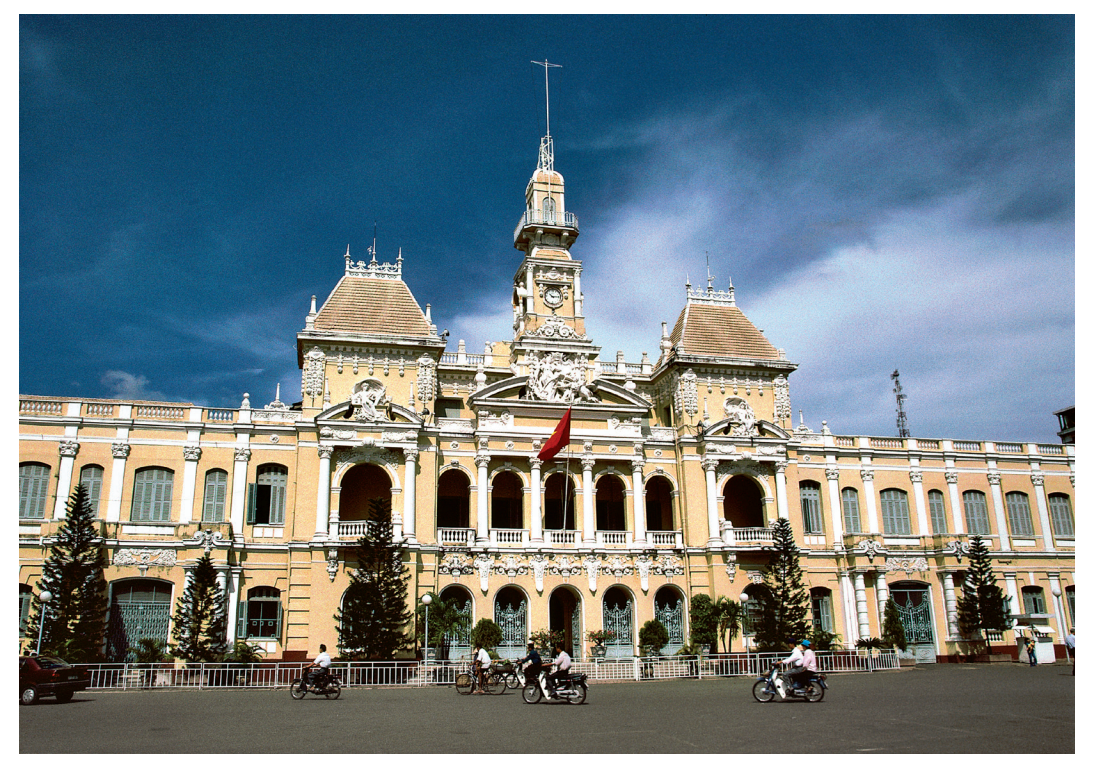
Observe the French architectural influences during a tour of Saigon on Day 13.

Day 7: Da Nang A morning walking tour of a nearby farming settlement reveals the daily life of a local community up close. Here rice paddies occupy every spare patch of ground, water buffaloes plow the fields, and villagers ride to market with produce piled high on their bicycles. B , L