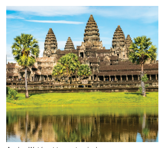
Angkor Wat (post-tour extension)

Day 15: Depart for U.S. Today we transfer to the airport for our return flights to the U.S. B