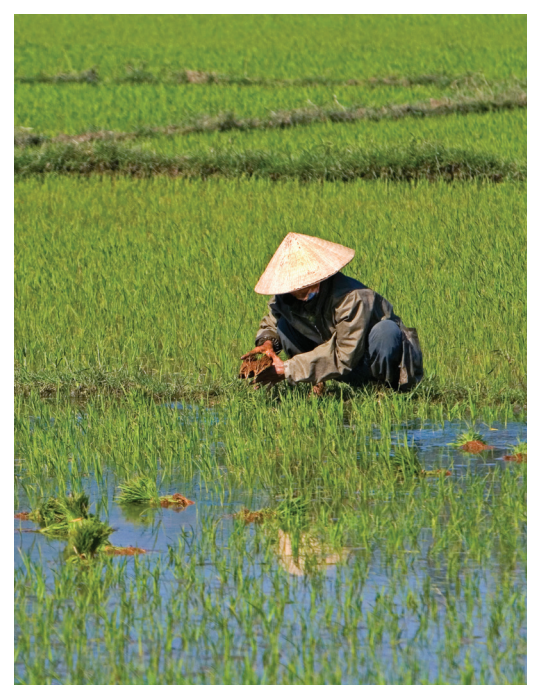
A local farmer tends a rice paddy.