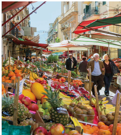
Colorful Sicilian street scene

Day 11: Taormina This morning we embark on a walking tour of this delightful medieval town set on a rocky terrace overlooking the Ionian Sea. Highlights include the 3 rd -century BCE Greek theatre, where gladiators once battled; the 13 th -century fortress-like Duomo ; and grand Piazza Vittorio Emanuele, site of