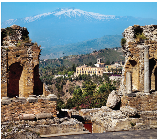
Taormina’s ancient theater overlooks Mt. Etna.

the ancient agora and today an inviting plaza. This afternoon is at leisure to enjoy Taormina as we wish; tonight we celebrate our Sicily adventure over a farewell dinner at a local restaurant. B,D