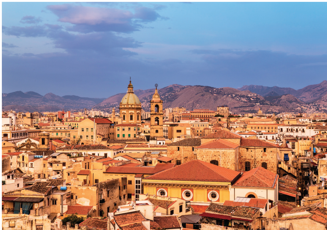
The sun rises over the city of Palermo.

cathedral, another gem of Arab-Norman Palermo and one of the finest examples of Norman architecture still in existence. The imposing main façade and ornate outer cloister serve to prepare us for the cathedral's breathtaking main sanctuary, where every inch of wall and ceiling space is covered with painstakingly detailed mosaics. Crafted by artisans from Constantinople (now Istanbul), the dazzling mosaics contain some 4,850 pounds of pure gold. Next we visit a nearby family-owned winery, where we enjoy a wine tasting and lunch. Our journey then continues; late this afternoon we reach Agrigento and our hotel, where we dine together tonight. B,L,D