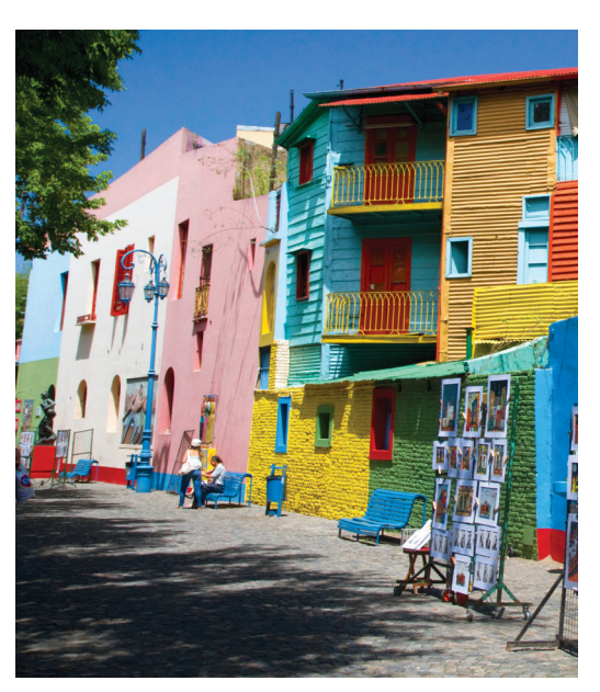
We visit Buenos Aires' colorful La Boca district on Day 3.