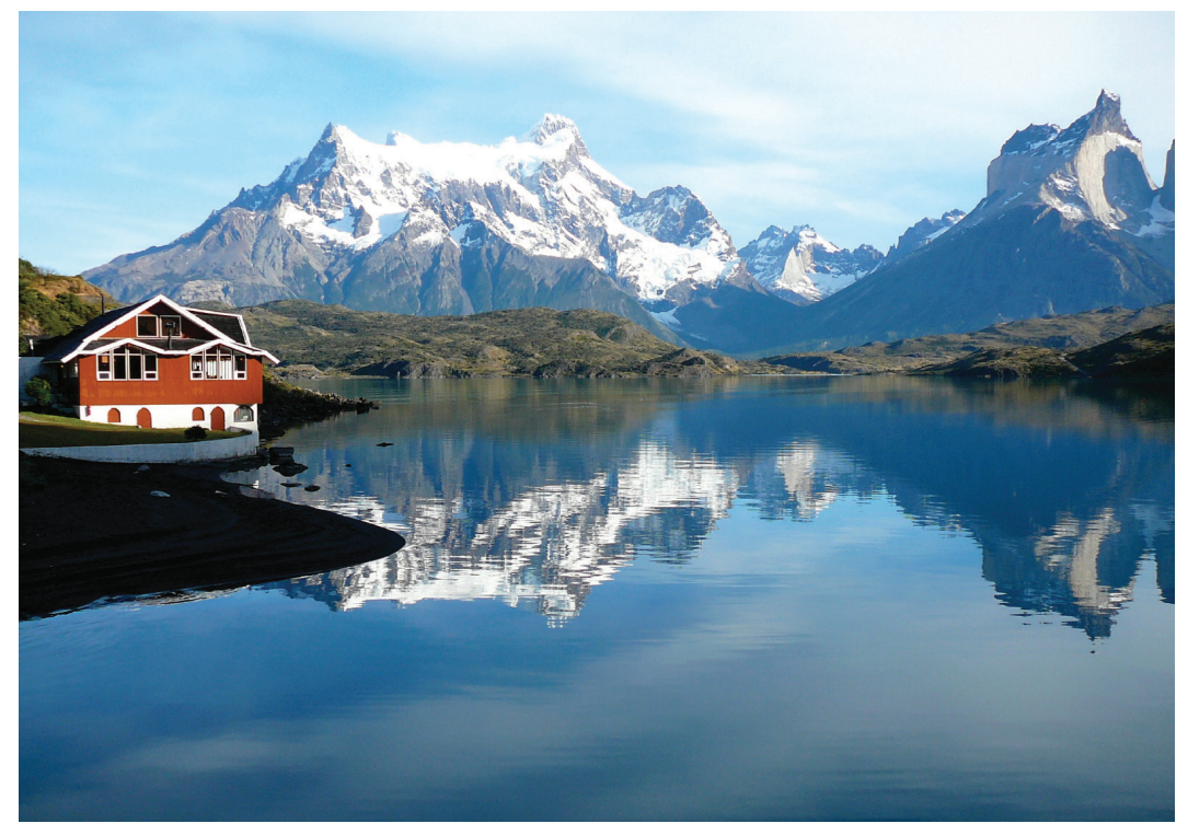
We see snowcapped mountain peaks, cascading rivers and waterfalls, glaciers, and mirrored lakes.