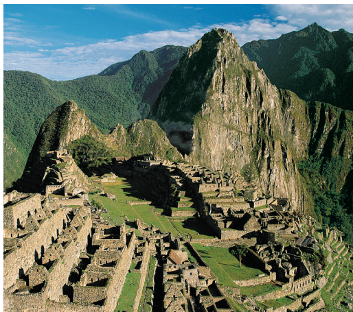
We explore the ruins at Machu Picchu on Days 5 & 6.

Day 15: Quito/Depart for U.S. This morning we visit Quito’s Botanical Gardens, featuring an orchidarium with more than 1,200 species of orchids; and