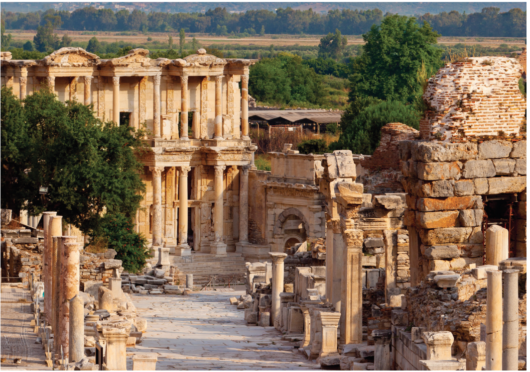
Ruins at Ephesus

Day 6: Istanbul/Gallipoli/Troy/Assos Leaving Istanbul this morning, we travel to the northern Aegean Coast for a brief visit to Gallipoli, haunting site of 31 Allied cemeteries from World War I. Then we ferry across the Dardanelles to Troy, once believed to exist only in Homer's epic poem until the present site was discovered in the 1870s. After touring here we continue south to Behramkale, ancient Assos, where we spend the night. B,L,D