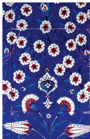
Exquisite Iznik tiles

Day 12: Fethiye/Antalya We set out this morning on a scenic drive along the coastal road to Antalya, stopping along the way in Demre (ancient Myra). Here we visit the 6 th -century Church of St. Nicholas, known for its impressive frescoes, its significance to both Roman Catholics and Eastern Orthodox Christians, and as its namesake’s inspiration for Santa Claus. Then we travel on to the evocative seaside ruins of Phaselis, the ancient Greek and Roman port