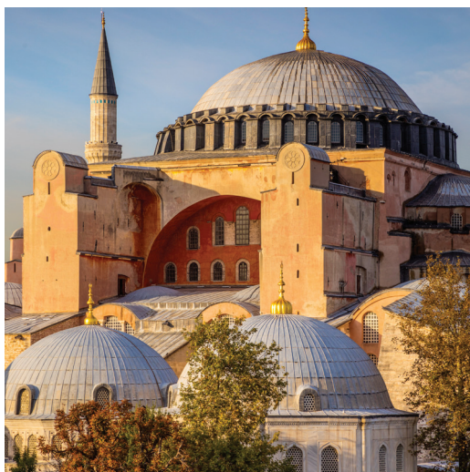
Istanbul’s Hagia Sophia

this afternoon is at leisure. Tonight, we celebrate our Turkish adventure over a farewell dinner at a harbor-side restaurant. B,D