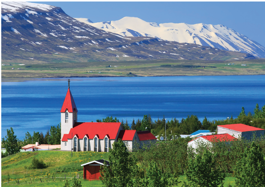
Iceland's landscape reveals an austere beauty.

the labyrinth of “echoing rocks” created by the spiral basalt formations of the arches and canyons here. Our last stop: jaw-dropping Dettifoss, Europe’s most powerful waterfall and Iceland’s “Niagara.” B,L,D