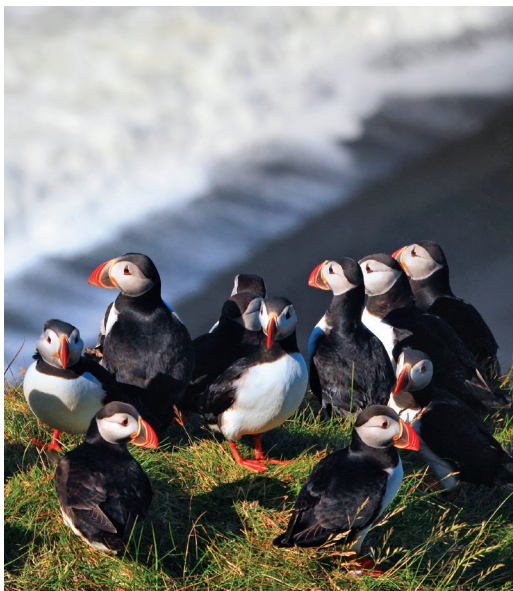
We may see puffins on our tour.