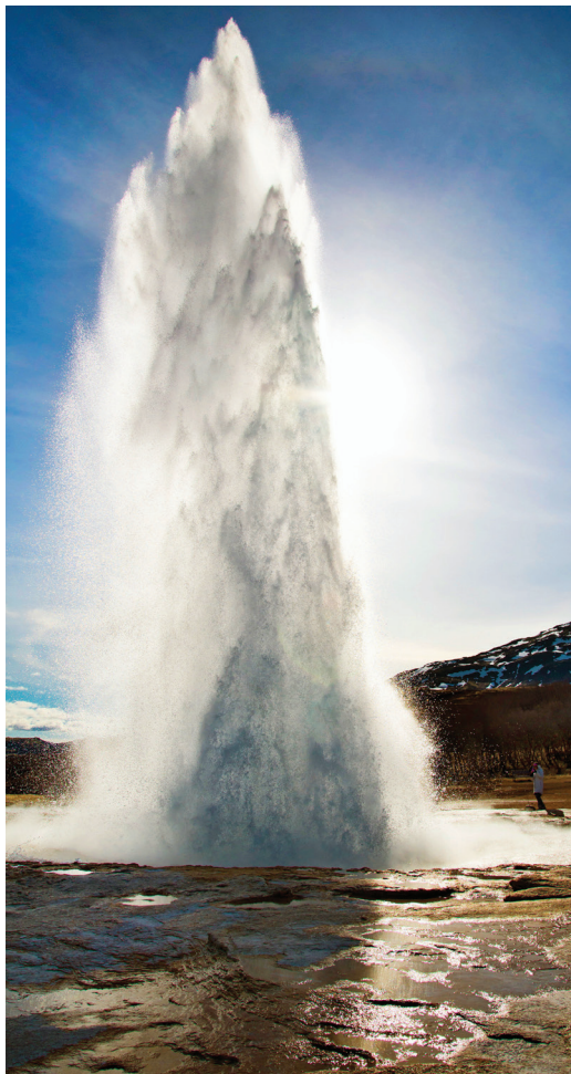
Iceland's hot spring geysers are famous natural attractions.

Day 11: Depart for U.S. Today we depart for the airport and our return flights to the U.S. B