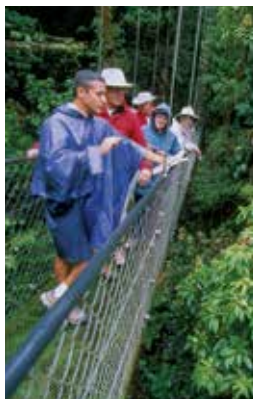
Arenal's Sky Walk

day at leisure along one of Costa Rica's most beautiful Pacific Coast settings. Dinner tonight is on our own. B,L