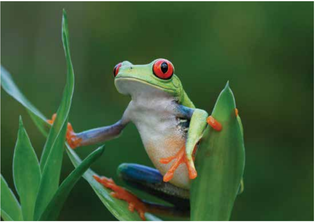
We see many colorful tree frogs in Costa Rica's rainforests.

Day 5: Arenal Region On this morning's visit to Arenal's hanging bridges Sky Walk, we have the special opportunity to experience the rainforest from the canopy level as we traverse a series of five suspension bridges high above the forest floor. While we observe the rainforest from a unique perspective, our naturalist guide will point out some of the flora and fauna that thrive here. Then we return to our hotel, where the remainder of the day is at leisure to relax amidst the beautiful grounds and thermal waters. Lunch and dinner today are on our own. B