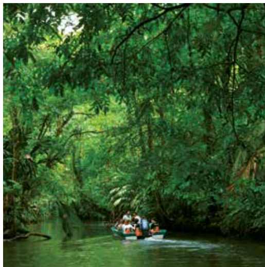
We explore Tortuguero's canals on the pre-tour option.

Day 11: Depart for U.S. We transfer to the airport this morning for our return flights to the U.S. B