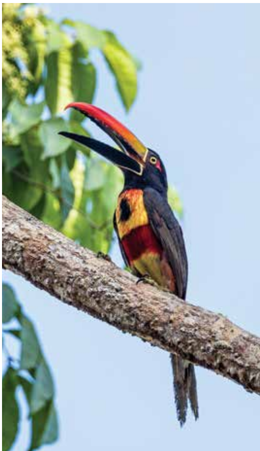
Fiery-billed aracari, a type of toucan