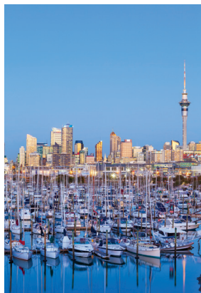
Auckland, City of Sails

Day 18: Queenstown/Rotorua We depart today for the Maori center of Rotorua, with its geysers, bubbling mud pools, and hot thermal springs. Upon arrival, we take a panoramic tour of this city on the shores of Lake Rotorua. This evening we visit Te Puia Thermal Reserve and Cultural Centre for a traditional hangi dinner and Maori performance. B,D