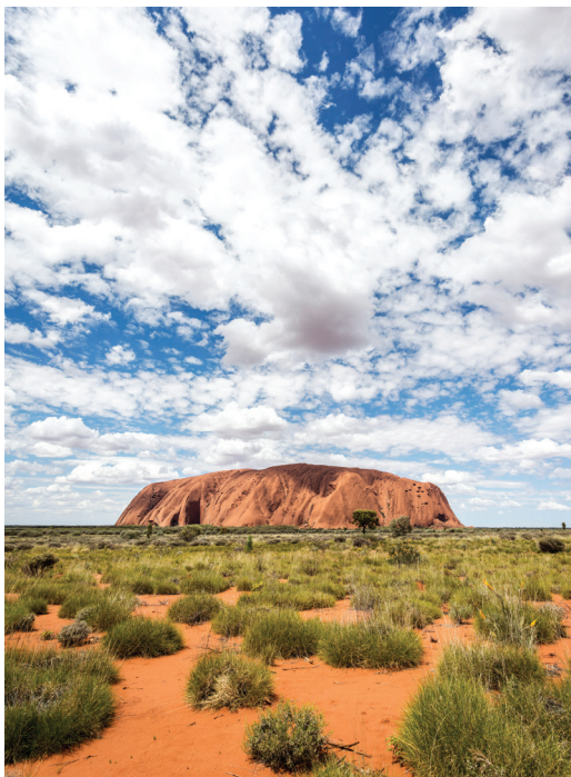
We visit the Aboriginal site of Uluru (Ayers Rock) on Day 8.