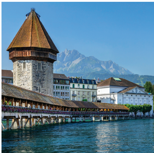
Lucerne’s beloved Kapellbrücke (Chapel Bridge)