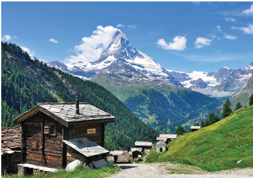
One of Europe's tallest peaks, the mighty Matterhorn presides over Zermatt.

Pass through the Alps. Late morning, we arrive in Stresa, Italy, along the shores of lovely Lake Maggiore, where we have time to explore and enjoy lunch on our own. Then a scenic drive through the famed Italian lake district returns us to Switzerland and our hotel in lakeside Lugano. B,D