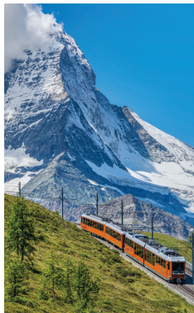
The Gornergratbahn open-air railway

Day 12: Salzburg Our walking tour this morning features the the 17 th -century Mirabell Gardens; the Baroque Old Town, now a UNESCO site; and visits to Salzburg Cathedral and medieval Hohensalzburg Fortress, one of Europe’s largest and best-preserved castles. This afternoon and evening are free for further exploration and lunch and dinner on our own. B