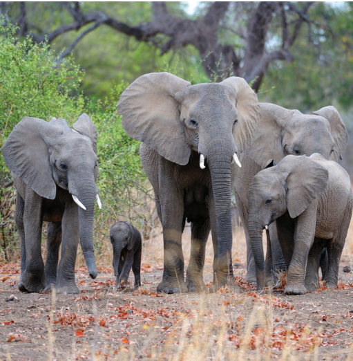
Elephants abound at Chobe

Day 13: South Luangwa National Park/Lusaka/ Depart for U.S. We travel by light aircraft today to Lusaka, Zambia’s capital, where we have hotel day rooms until our departure this evening for the airport and our overnight flight to the U.S. B