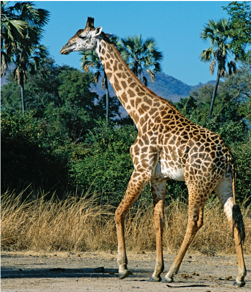
South Luangwa giraffe

Day 14: Arrive U.S. We arrive in the U.S. this morning and connect with our flights home.