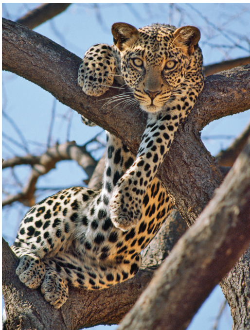
Getting comfortable ...