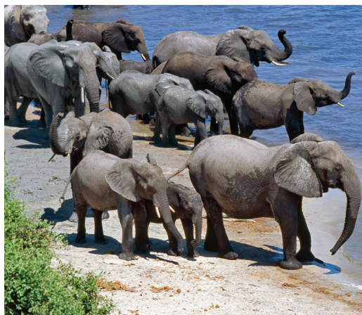
Elephants abound at Chobe.

Day 14: Arrive U.S. We arrive in the U.S. this morning and connect with our flights home.