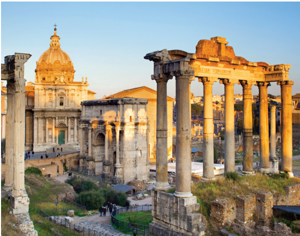
We tour Rome’s Forum on Day 6.

Day 16: Depart for U.S. We depart early this morning for our connecting flights to the U.S. B