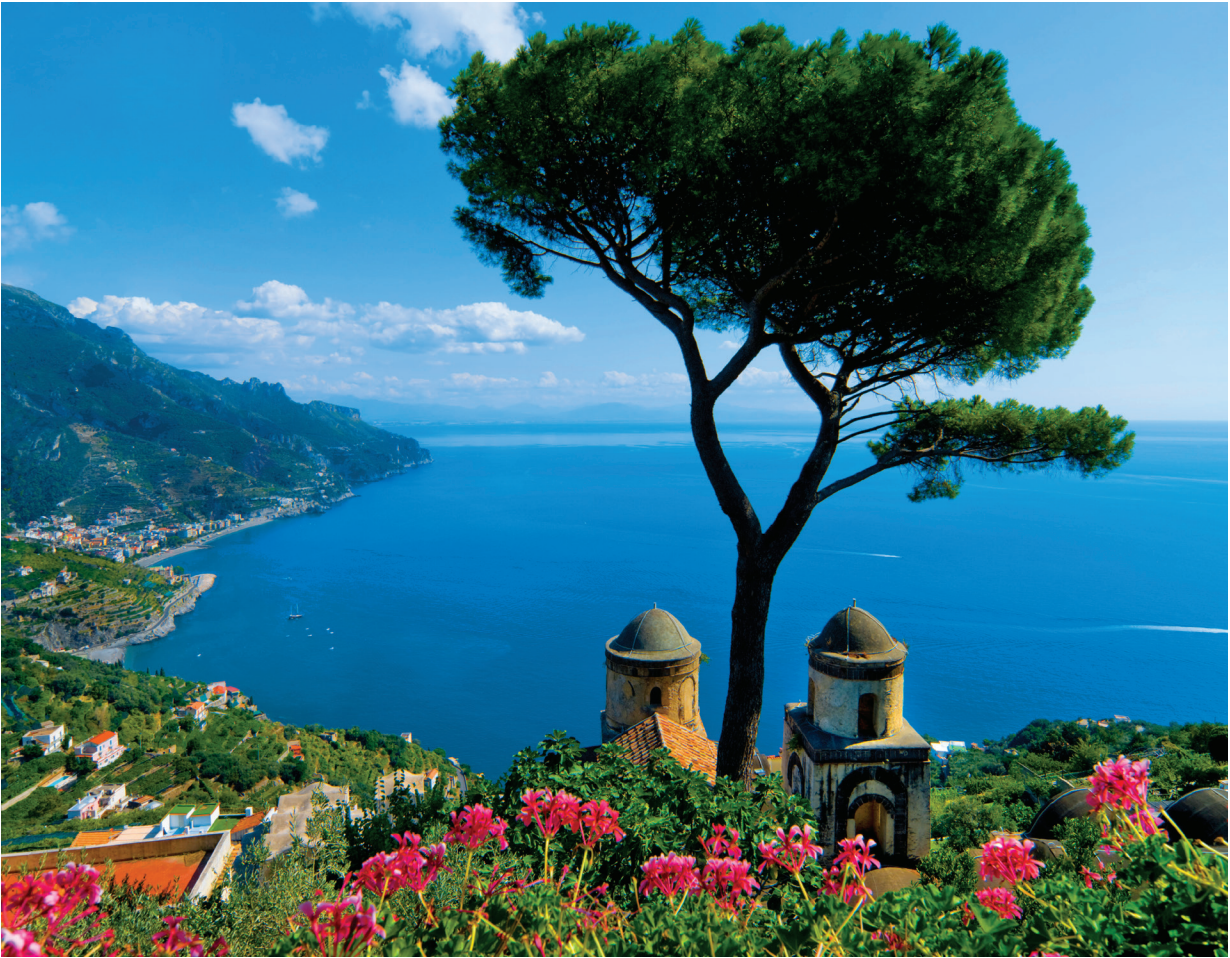
Listed as a UNESCO site, the Amalfi Coast boasts colorful villages and stunning scenery overlooking the Tyrrhenian Sea.