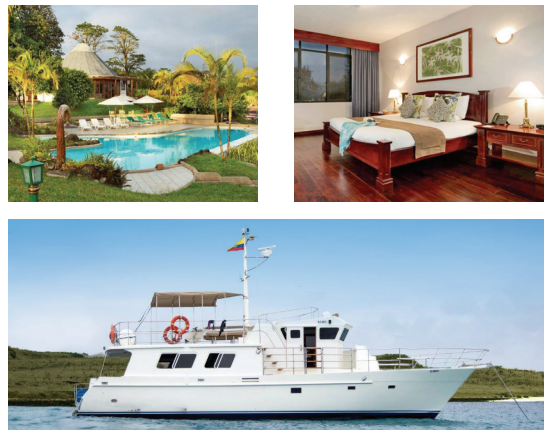
We stay in comfort for four nights in spacious rooms at the Royal Palm Galapagos, set in the lush highlands of Santa Cruz island, and enjoy day cruises aboard the Santa Fe , our privately chartered yacht.

Day 11: North Seymour Island/Bachas Beach This morning we board the Santa Fe , our privately chartered yacht, for North Seymour, a flat, low-lying island with ample opportunities for close encounters with the wildlife on our naturalist-led walk. After