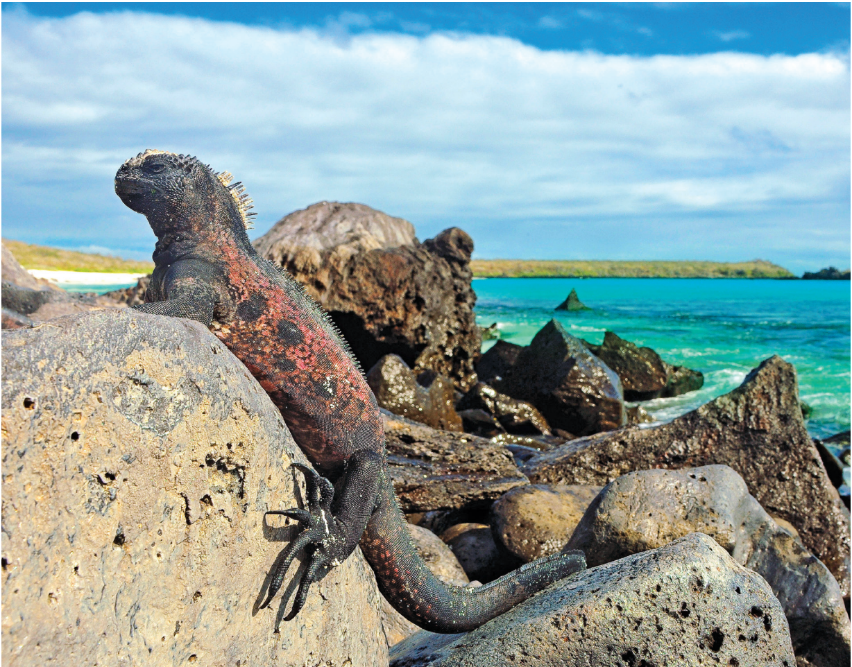
We'll encounter plenty of wildlife in the Galapagos, including relatives of this marine iguana.