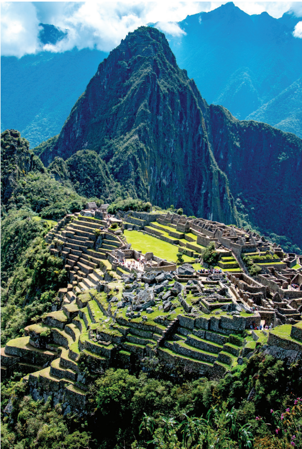
We explore the amazing ruins at Machu Picchu on Days 5 & 6.

Day 16: Arrive U.S. We arrive in the U.S. this morning and connect with our return flights home.