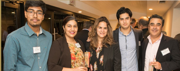
International Engagement & Alumni Travel