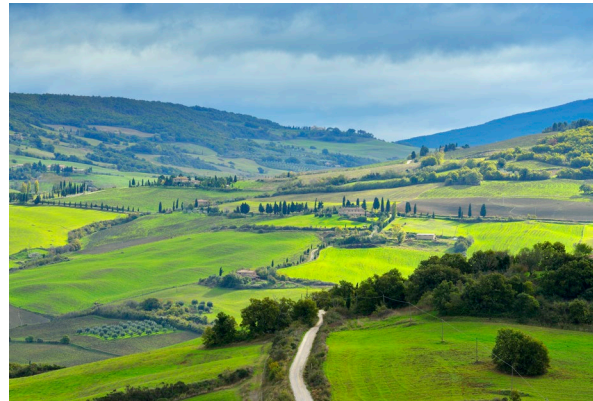
Portrait of Italy – Purdue Exclusive Departures April 10-25, 2025 & October 27 – November 11, 2025