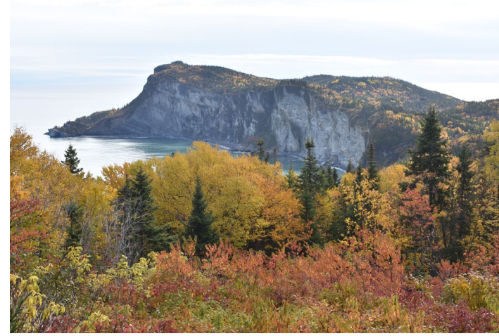
Fall Tableau of Canada & New England September 24 – October 5, 2025