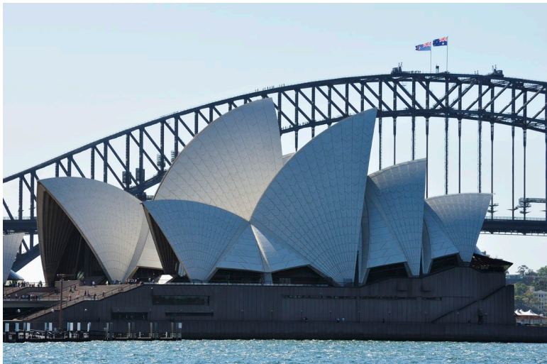
Exploring Australia & New Zealand March 26 – April 16, 2025