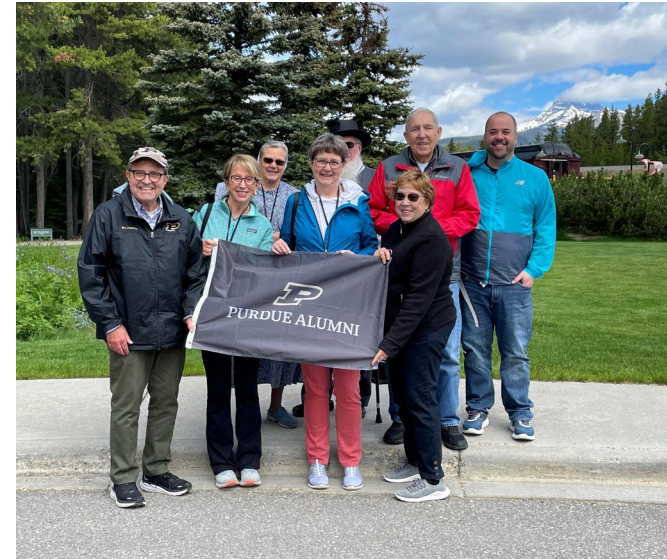
Canadian Rockies (Orbridge) - July 2022