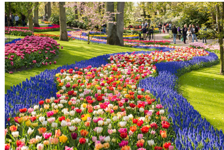
Dutch Waterways April 23 – May 1, 2025