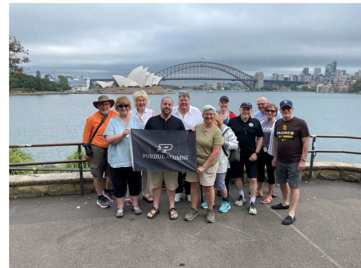
Exploring Australia & New Zealand (Odysseys Unlimited) - January 2023