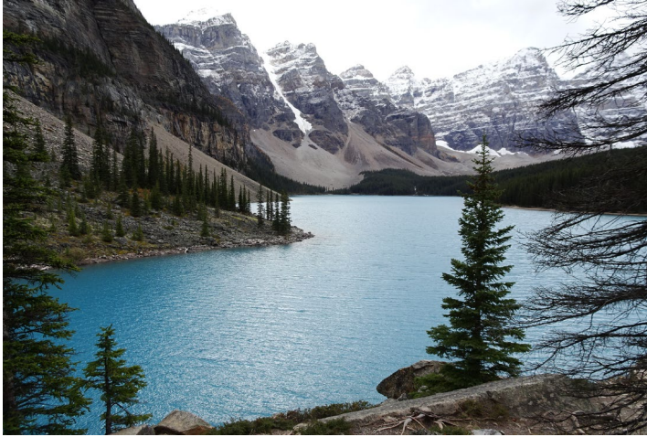
Discover the Canadian Rockies by Rail August 9-15, 2025