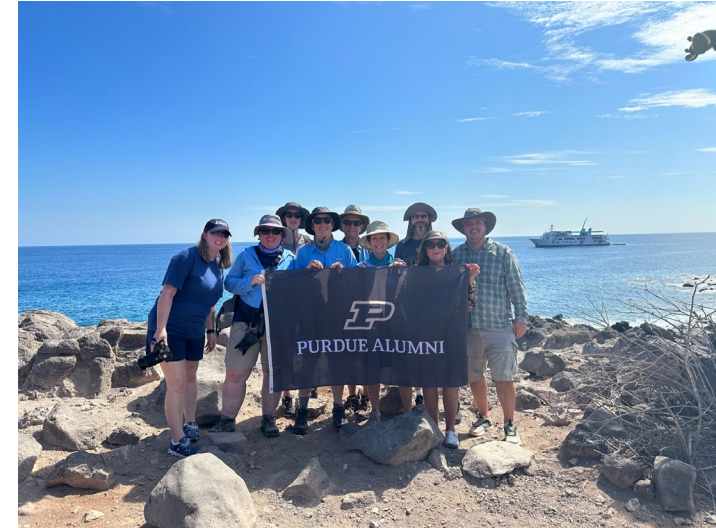
The Galapagos Islands (Orbridge) - March 2023