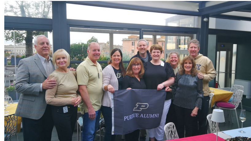
Rome, Italy (Odysseys Unlimited) - April 2022