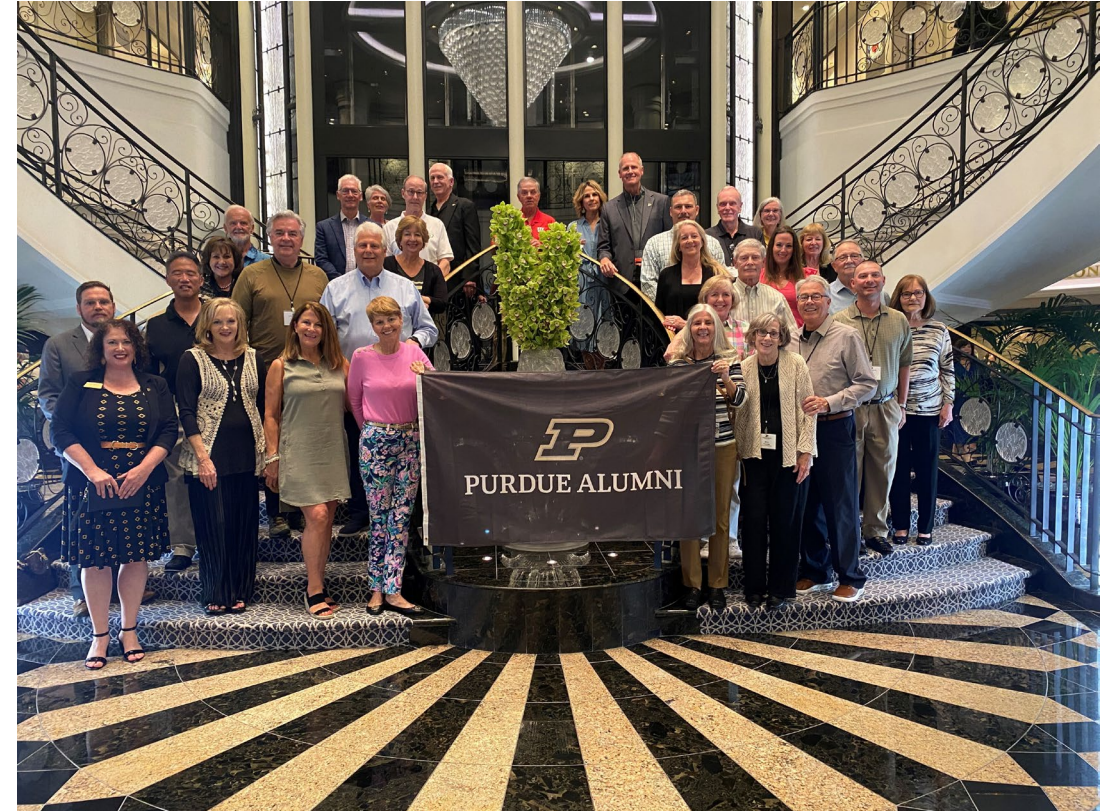
Picturesque Mediterranean (Go Next & Oceania Cruises) - April 2023