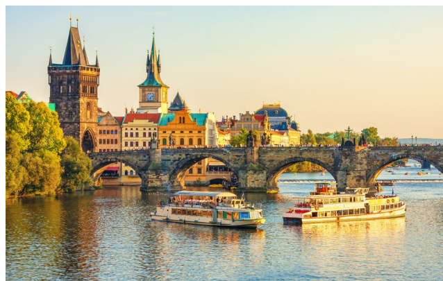
Grand Danube Passage May 14-28, 2025