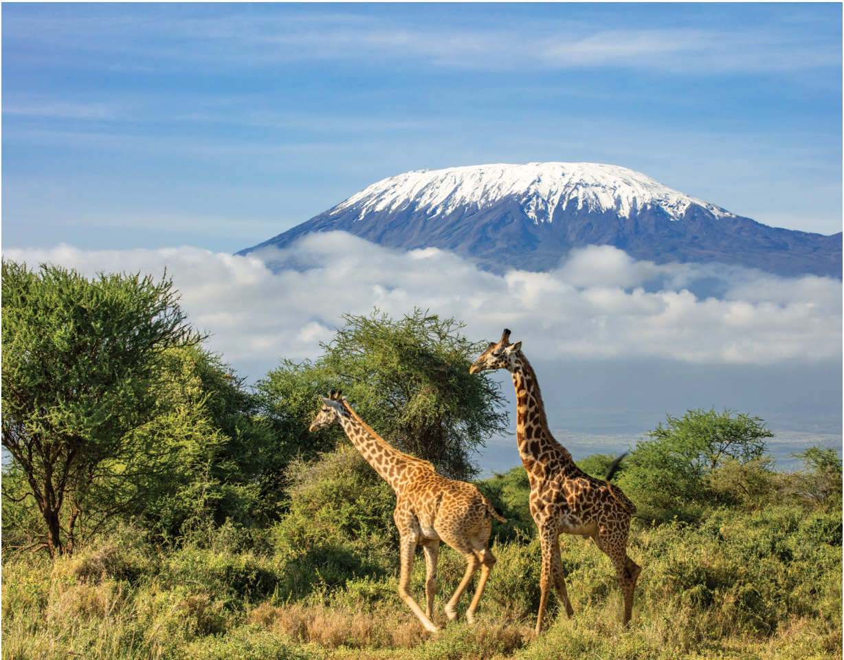
Giraffe roam Amboseli National Park in the shadow of Mt. Kilimanjaro.