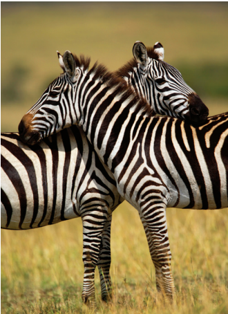
We’re sure to see zebra.

Day 11: Serengeti/Masai Mara We leave Tanzania today, crossing into Kenya and continuing on to Masai Mara by air. Kenya’s premier game reserve rich with animal life, the Mara is the traditional homeland of the Indigenous Maasai people. Known especially for the annual migration that sees some two million wildebeest, plus hundreds of thousands of other plains game migrate here from the Serengeti (Masai Mara being the continuation of the Serengeti in Kenya), the Mara sits in the Great Rift Valley and comprises