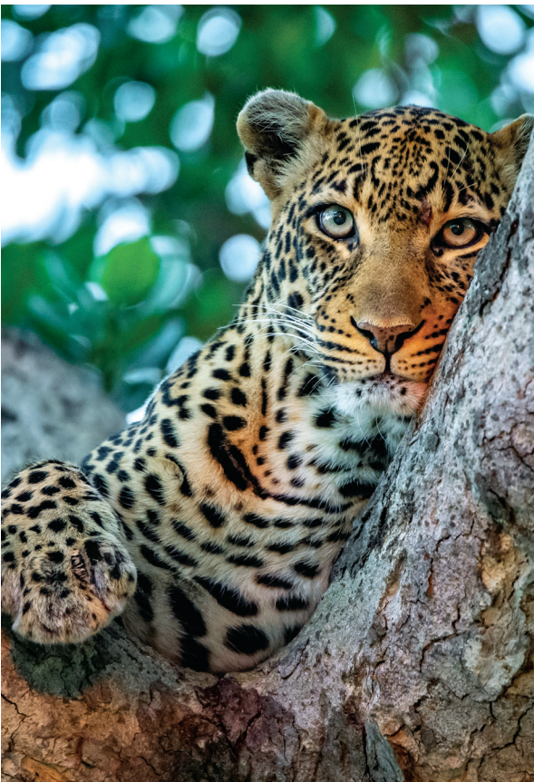
Leopard in the Serengeti