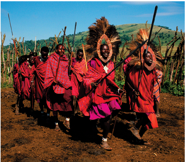
Kenya’s native Maasai people

Day 16: Arrive U.S. We reach the U.S. today and connect with our flights home.