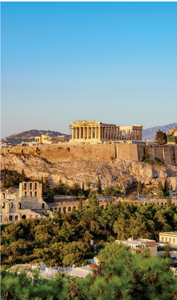
On Day 3 we visit the Acropolis in Athens.