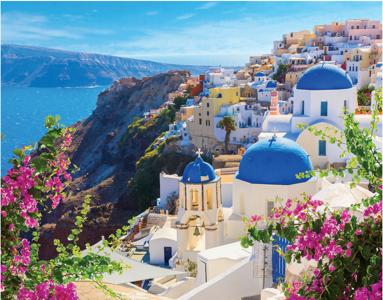
With its whitewashed houses and cobalt domes high above the Aegean, Santorini draws visitors from far and wide.