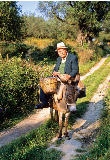
Old ways endure ...

Day 7: Nafplion/Hydra This morning we travel to the port of Metohi, where we board a private boat for the ride to Hydra, the car-free Saronic island where donkeys provide the transportation. After lunch together at a local taverna , we have free time to enjoy this picturesque island as we wish. Late afternoon we return to Nafplion for an evening at leisure. B,L