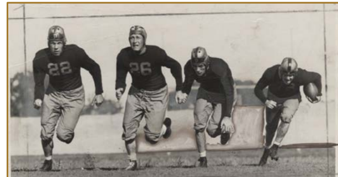
The Boilermaker Backs, 1935